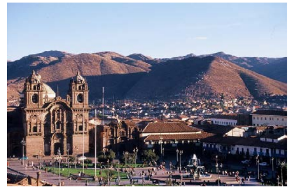
City of Cusco

In the afternoon, explore the magical capital of the Incas in a tour that includes the Santo Domingo monastery, which was built over the Koricancha temple, one of the most important temples dedicated to the worship of the sun. According to the chronicles, it was covered in gold leaf and filled with golden representations of nature. Stop at San Cristobal for a magnificent view of the city of Cusco, before proceeding to the nearby remarkable Inca ruins in the area: the fortress of Sacsayhuaman, the temple and amphitheatre of Kenko, and the archeological site of Tambomachay, where the god "water" was worshipped. Return to Cusco and stop briefly at Plaza Regocijo and Plaza de Armas, to continue with the visit of the Cathedral, the most important temple of the city which houses the headquarters of the Diocese. At theend of the tour, transfer to hotel.