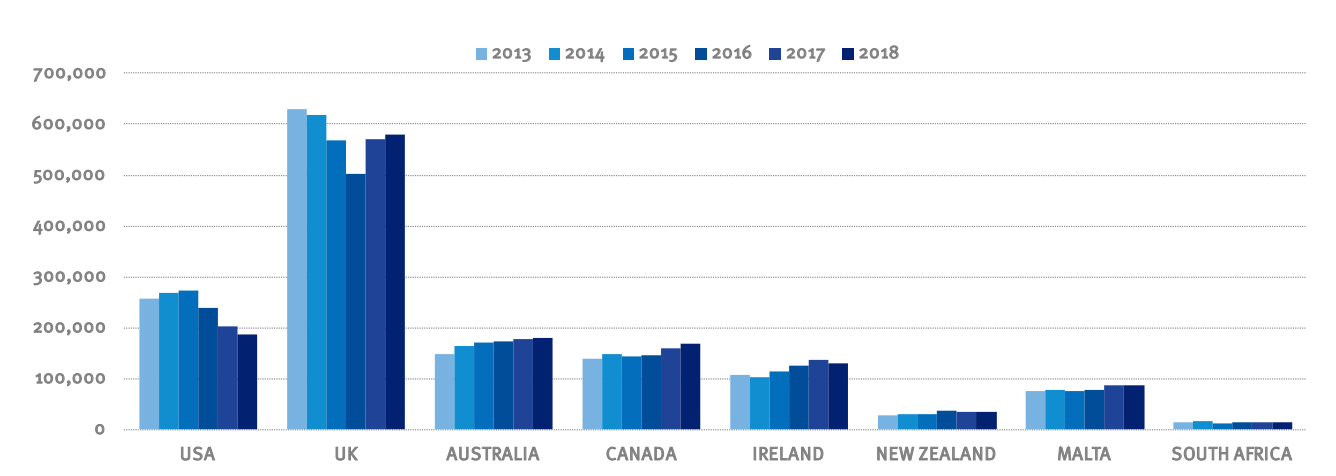
Chart 2: Overview of ELT destinations (student numbers)

Figures represent extrapolations based on multiple sources. They cover all centres in the destinations and represent the best possible calculation, rather than a headcount.